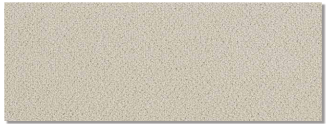
High Cotton KHAKI