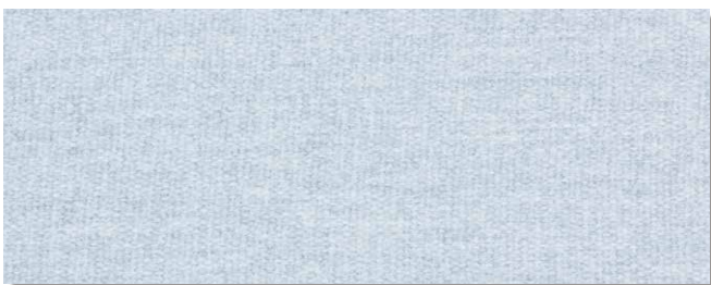
Dorset SILVER GREY