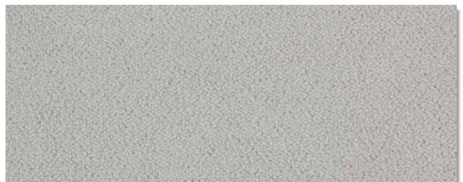
High Cotton HAZE